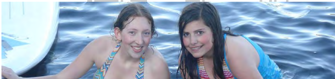
Fun! Camp 2009