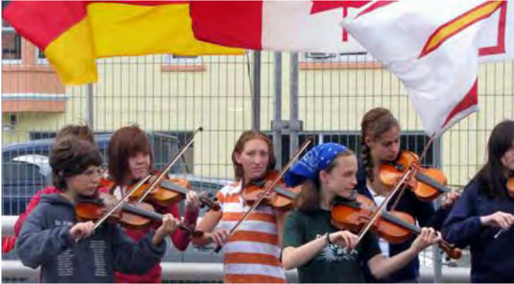
STEP fiddlers play for cruise ship tourists