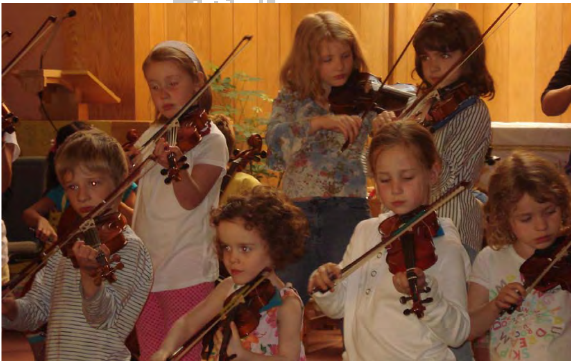
Hanging out with friends. Camp 2009